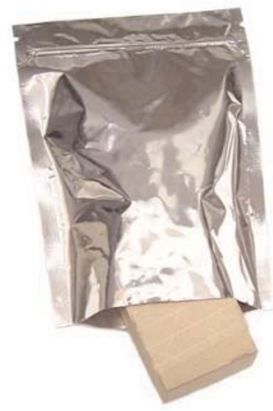
SCC RipTop Bags

SCC's RipTop bags are made with the bottom open and the bag closed (fold) above the zipper. Product is loaded from the bottom and is kept inside the bag by heat sealing across the opening. To access the product, the customer Rips the Top off of the bag above the zipper. The zipper allows the customer to use the bag again.