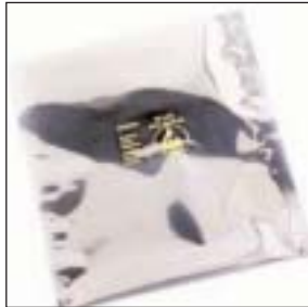
RT30 and SCC 1000