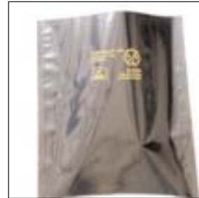
RT36 and Dri-Shield 2000